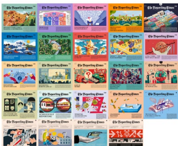
24 issues of our bi-annual publication "The Reporting Times"