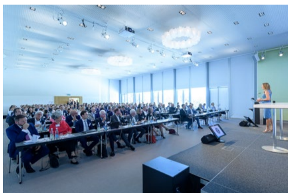
15 years of the Geschäftsberichte-Symposium – knowledge and network