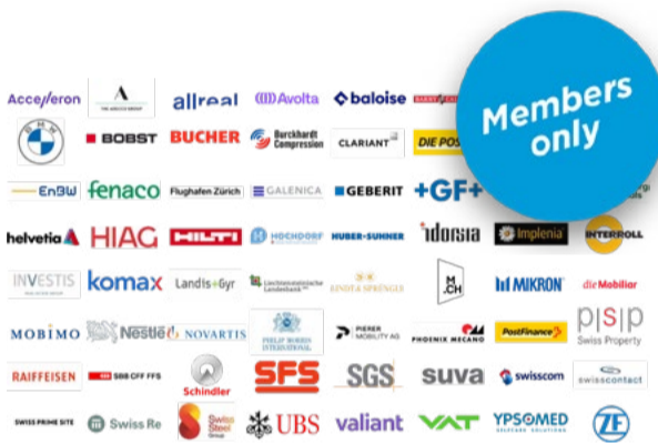
CCR community – more than 80 member companies