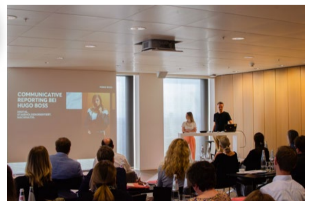
CCIR Forum Reporting in Frankfurt with a focus on communications and design, content and language of corporate reports