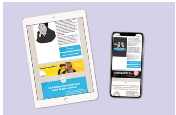
4 to 6 digital "Reporting Insights" featuring authors' analyses and opinions on the latest topics in corporate reporting