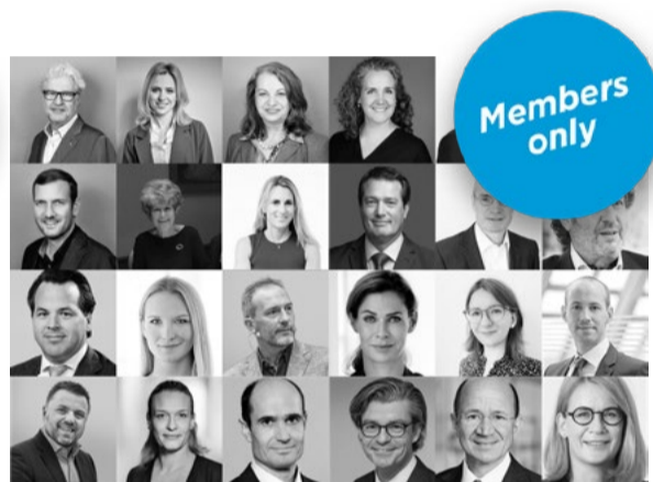
Foundation of the CCR panel of experts and CCR advisory board to respond to member enquiries, identify top trends and set the agenda