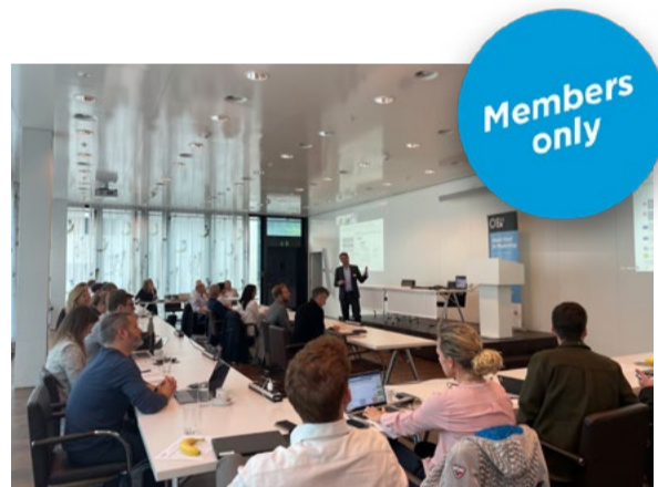
Regular Roundtables to promote the exchange of practical experience & peer learning