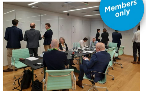
Corporate Reporting Monitor & Future Lab – multi-year study based on desk research, surveys and various workshops to serve as a compass of global trends and their impact on reporting